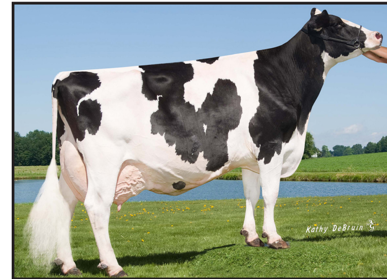
5th Dam: Miley Affirmed W Tiffany-ET EX-94 4E