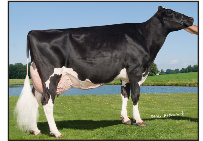
Maternal sister to Granddam of Lots 1 & 2 : Miley Planet Best Glow EX-90