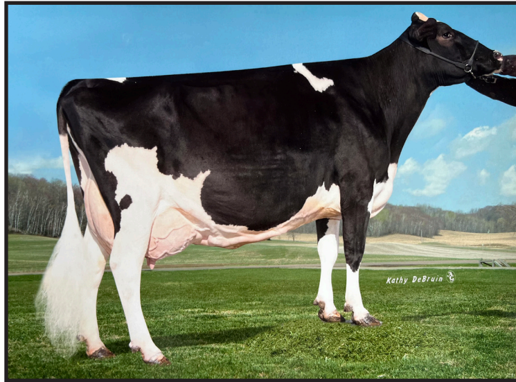
4th Dam: Miley Roy Bumblebee EX-93