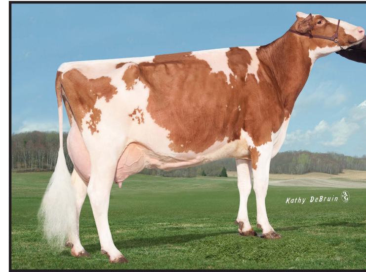
3rd Dam: Miley Advent B Gem-Red EX-93 2E Grand Champion Ohio State Fair R&W 2011 &2012 Grand Champion Spring Dairy Expo R&W 2012 2011 National Holstein Futurity Winner