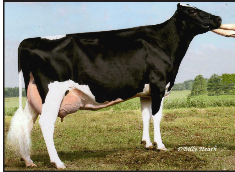
4th Dam of Lot 17: Miley Leduc M Butterfly-ET EX-93 3E