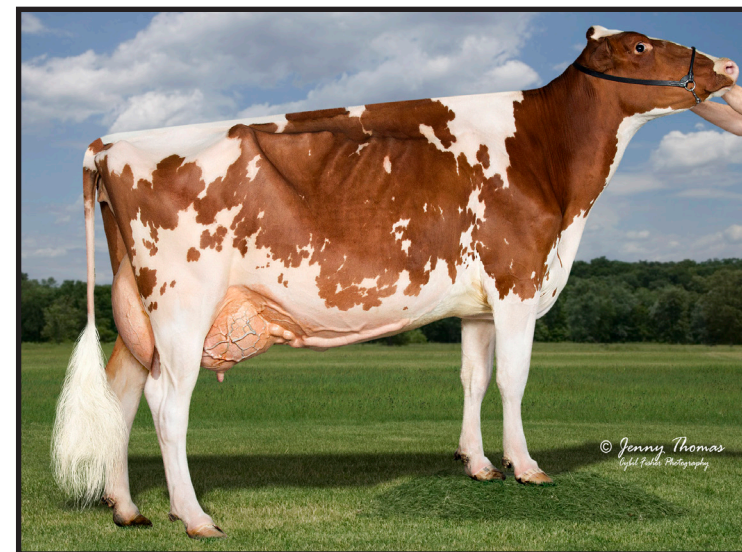
Maternal sister to Granddam of Lot 14: Miley Attitude Gloss-Red-ET EX-90 2E