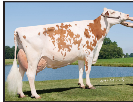
3rd Dam: Miley Redliner Gemma-Red EX-90