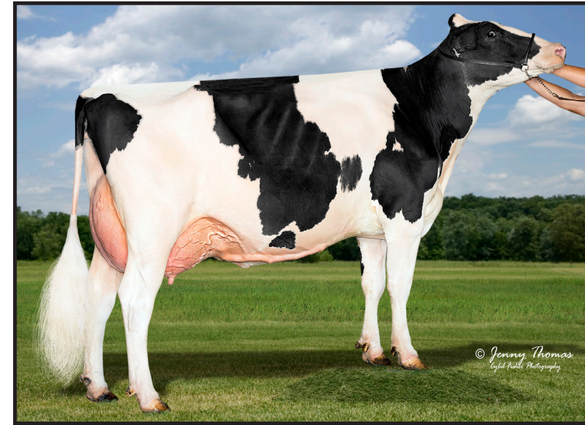
3rd Dam: Miley Woodbrook Glee EX-91