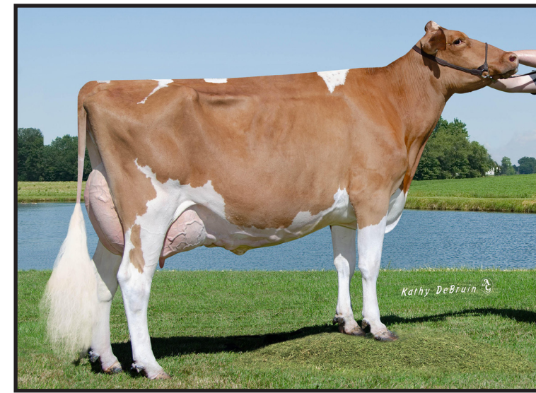
Maternal sister to Granddam of Lot 12: Miley Awesome Gemini-Red EX-91 2E