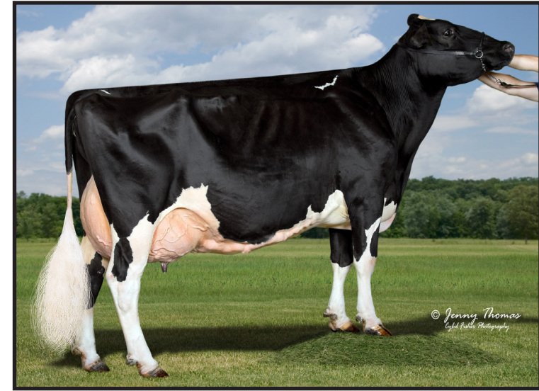
4th Dam of Lot 16: Miley Roy Select Excitement EX-94 3E Grand Champion OH State Fair Jr Show 2012