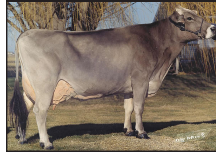
6th Dam of lots 21 & 22: Top Acres Present ET EX 94 5E