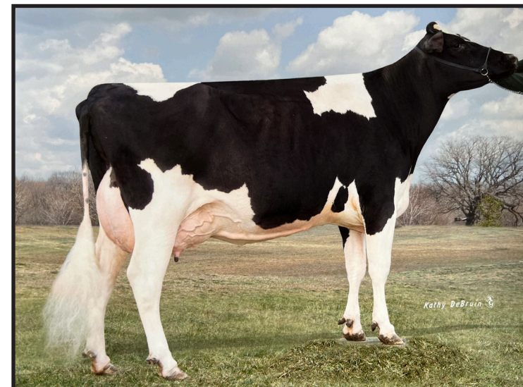
5th Dam: Miley Dundee Holiday-ET EX-90