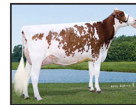
Sister to dam: Miley Awesome Gerri-Red VG-88 EX-MS