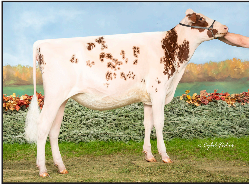
Full Sister to Lot 11: Miley Warrior Gentle-Red VG-86 Reserve All-American Summer Yearling 2023