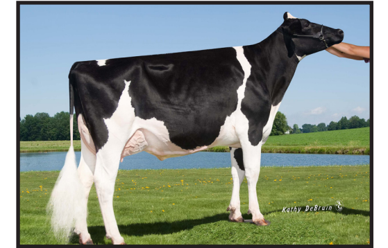
4th Dam: Miley Atlantic DD Ginelle VG-87