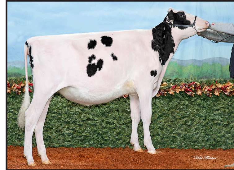
Full Sister to Dam: Miley Avalanche Genessee-ET VG-87 Nominated All-Canadian Fall Calf 2018 Supreme Jr Champion Spring Dairy Expo 2019