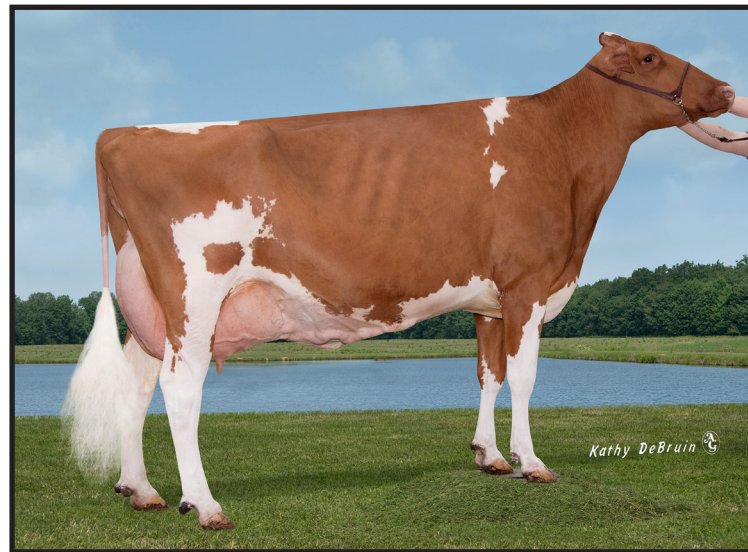
Maternal Sister to Dam: Miley Reality Gisele-Red EX -90 2E