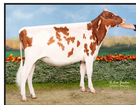
Daughter of Glider: Miley Warrior Grande-Red-ET Nominated All-American R&W Winter Yearling 2024