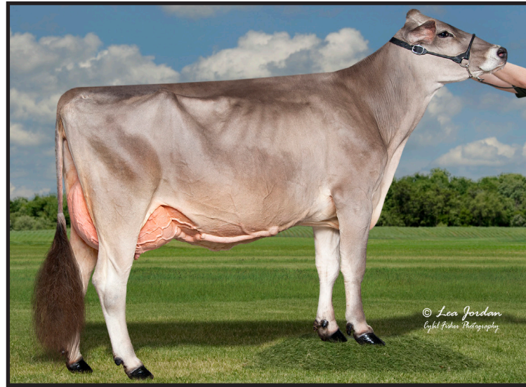
Granddam: Miley Bosephus Princess EX-91 2E Nominated All-American 4-Year-Old 2023