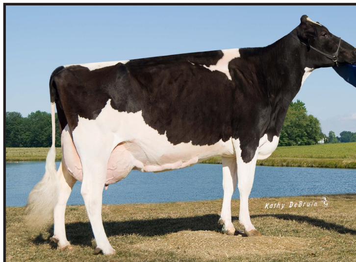
3rd Dam of Lot 27: Miley Roy Lee Maisie EX-94 3E