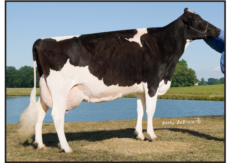
4th Dam: Miley Roy Lee Maisie EX-94 3E