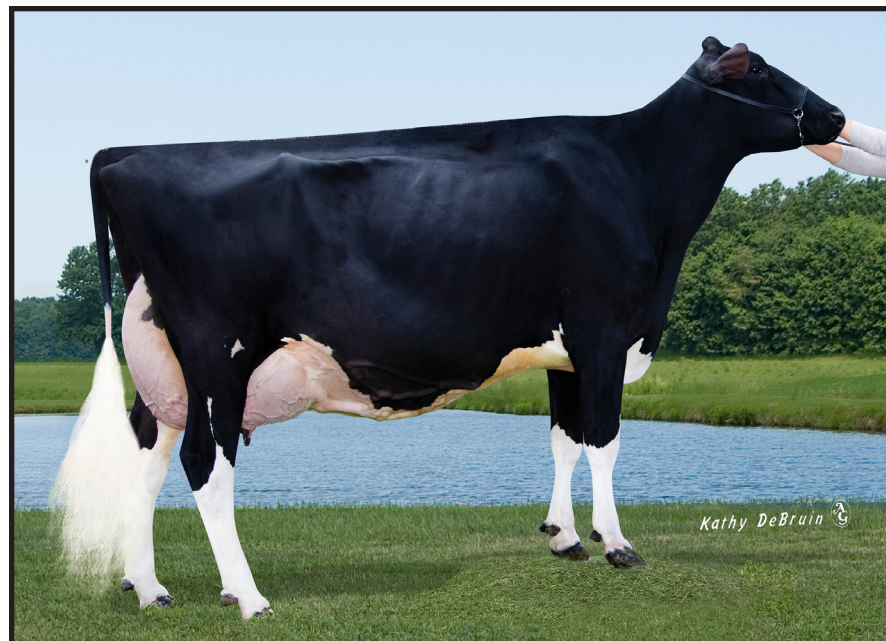
Dam: Miley Diamondback Glide EX-94