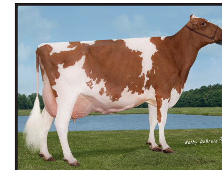
3rd Dam: Miley Debonair Glitter-Red EX-94 2E