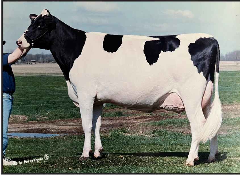
4th Dam: Miley Charles BS Henna EX-93 4E DOM