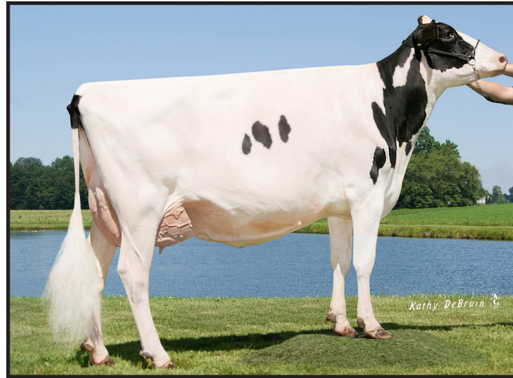
Dam of Lots 1 & 2: Miley Windbrook Grandslam EX-91