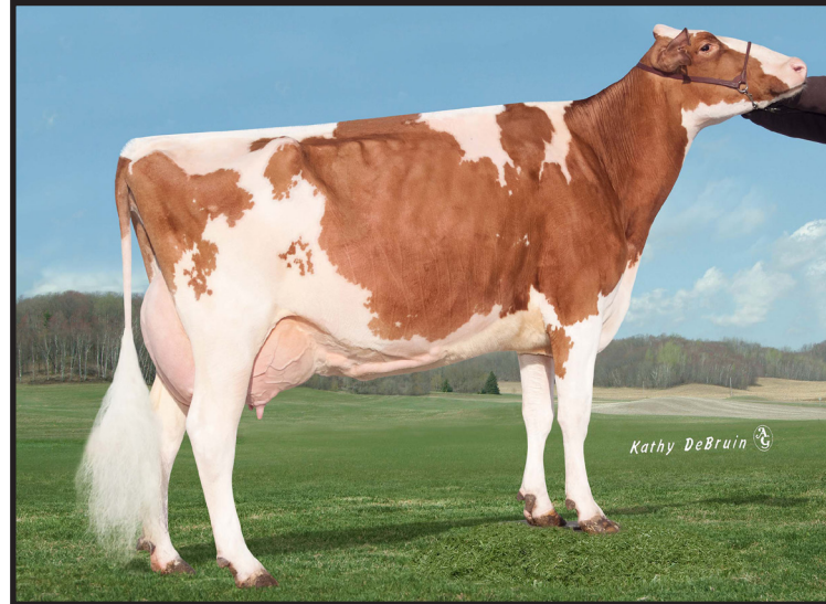
2nd Dam: Miley Advent B Gem-Red EX-93 2E Grand Champion Ohio State Fair R&W 2011 &2012 Grand Champion Spring Dairy Expo R&W 2012 2011 National Holstein Futurity Winner