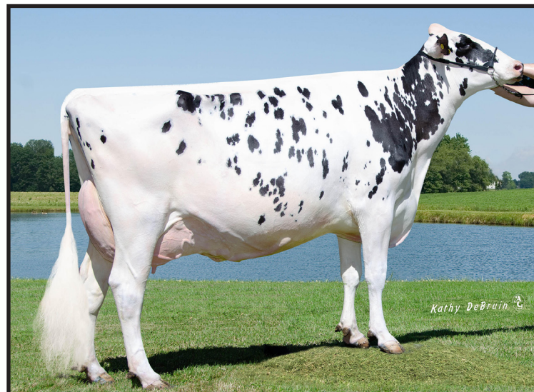
Granddam: Miley Solomon Gospel EX-94