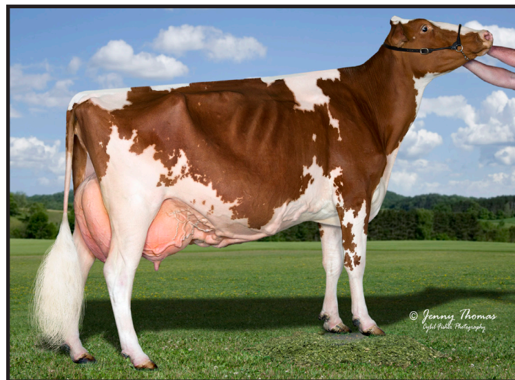
3rd Dam of Lot 13: Miley Advent B Gemini-Red EX-91 2E