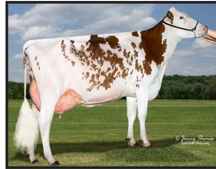
Granddam: Miley Ladd Grasshopper-Red EX-94 3E