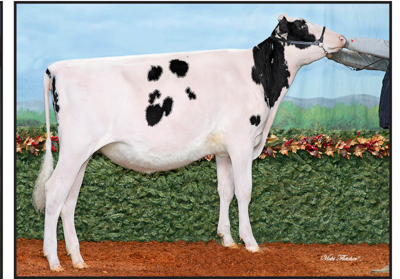
Full Sister to Granddam: Miley Avalanche Genessee-ET VG-87 Nominated All-Canadian Fall Calf 2018 Supreme Jr Champion Spring Dairy Expo 2019