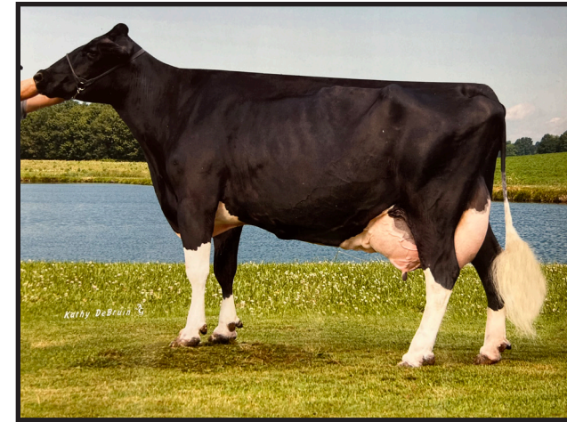
4th Dam of Lots 1 & 2 Miley Durham SW Gava EX-91 2E DOM