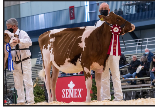
Same family as Lot 19: Miley Analyst Harmony-Red VG-85 CAN 1st R&W Winter Calf Canadian Nat'l Show 2021