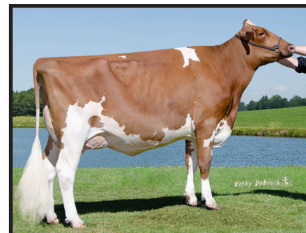
Full sister to Glide: Miley Diamondback Glider-Red VG-88