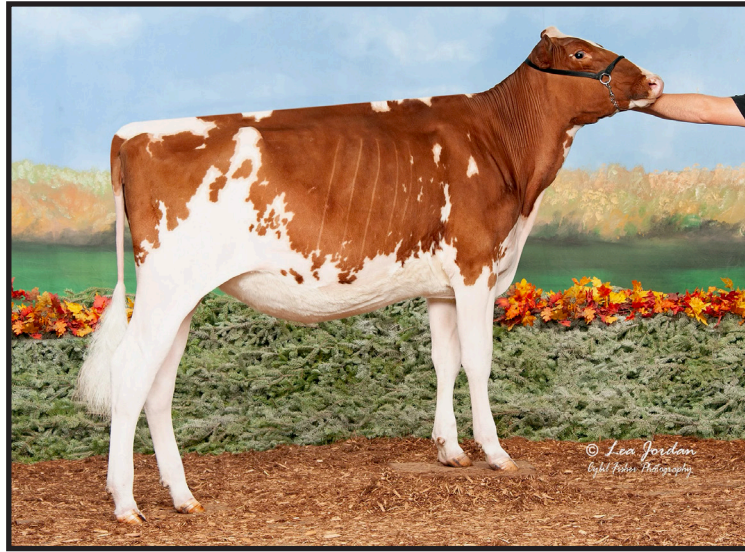
Same Family as Lot 15: Miley Warrior Graceful-Red VG 87 Nominated All-American Summer Yearling 2023