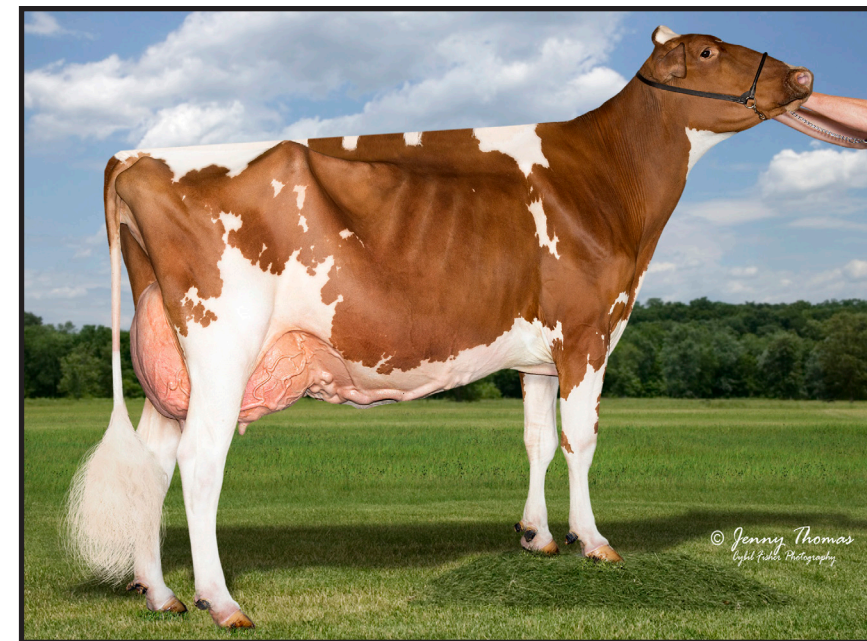
2nd Dam: Miley Redburst Glitz-Red EX-93 2E