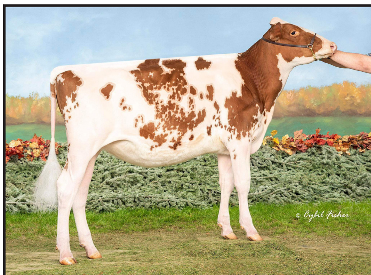
Maternal Sister to Dam: Miley Warrior Galore-Red Nominated All-American R&W 2023 & 2024